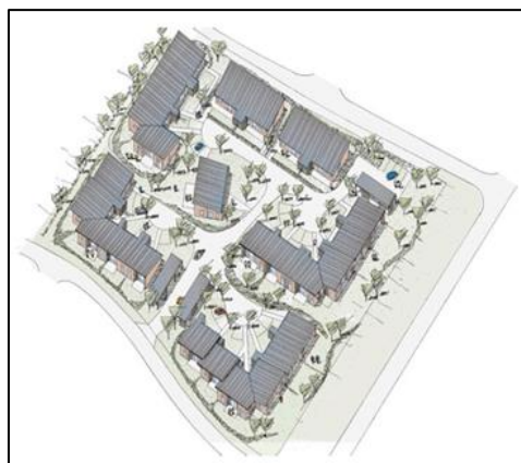
Figure 4. Tanderparken senior co-housing, close to Aarhus

of new residents was rated as a positive experience by 91 per cent of new residents, and 92 per cent of longer-term residents. There was also little difference on satisfaction rate between new and longer-term residents, indicating that the perceived value of the co-housing community does not decline or increase with time spent in the facility. There was an overwhelmingly high satisfaction rate of 95 per cent among residents in the co-housing facilities. While these are very high levels of satisfaction, it is not possible to know how these responses compare to those of elderly residents in non-co-housing dwellings.