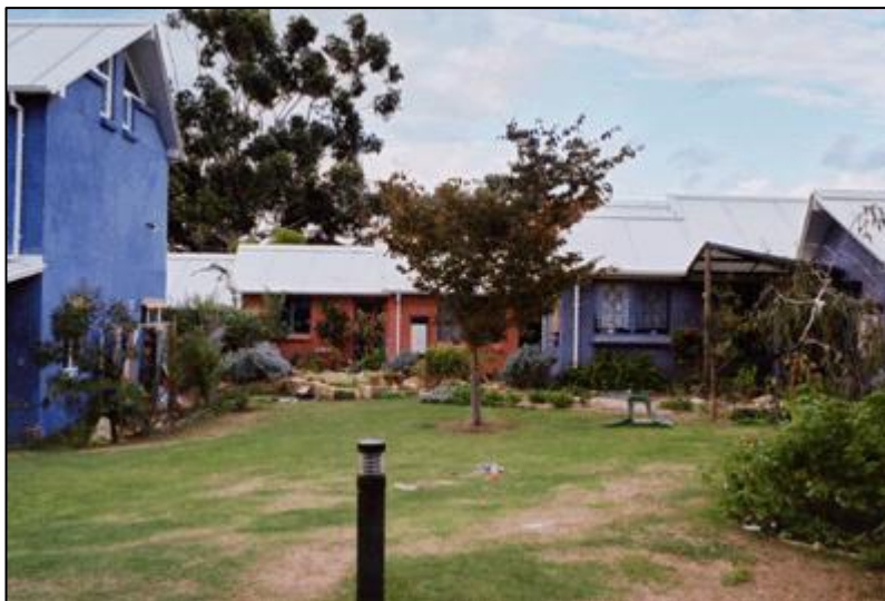
Figure 2. Pinakarri Co-housing Community in Fremantle, WA

intentionality of ICs tends to limit their size as the scale is frequently determined by the number of willing, able, and interested households. A frequently cited rule-of-thumb is that one in ten ICs will survive from an idea to a completed development, and that it will take ten years to do so.