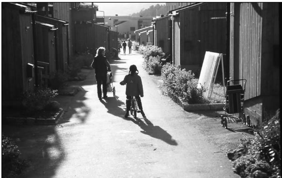
Figure 3. Hallagerbakken housing co-operative, Holmlia satellite town, Oslo.

OBOS's last large-scale satellite town was Holmlia – it was completed in 1982, with 4 300 housing units and around 12 000 inhabitants organised in 11 different neighbourhoods. It incorporated car free zones, public transport hubs, schools, play-grounds and nature areas. It was a modular low-rise development that followed the natural contour lines of the terrain. The result was dense but also airy; urban but in nature; imaginative but thoroughly thought through design. 284 The project reintroduced concepts of community and neighbourhood, which had been lacking in the earlier projects, and created a distinct Norwegian identity and context.